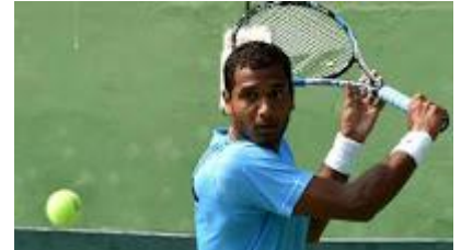
i. Muttiah Muralidaran , the