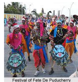
Festival of Fete De Puducherry

ii. The Puducherry government has been holding the festival since 1985 as part of celebrating Independence Day and also Liberation Day of Puducherry (August 16).